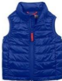
ZIP UP VEST