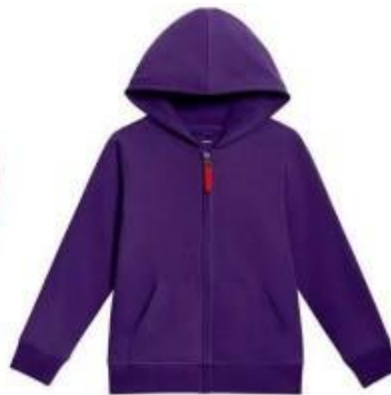
ZIP UP HOODIE