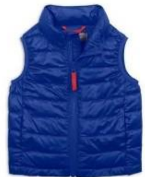
ZIP UP VEST