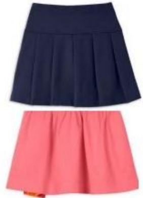
KNIT SKIRT COTTON SKIRT